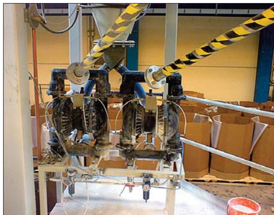
ARO powder pumps 2" size, model PP20A-BAP-AAA supplying calcium-carbonate powder into machine for formulation to make granulates.