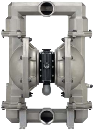
PH30F-BSS-SAA-C 3" 2:1 ratio diaphragm pump

High pressure diaphragms pumps 1" size, 3:1 ratio, model PH10A-BSS-STT used to circulate fluids from original tank, to point of use and then back to original tank.