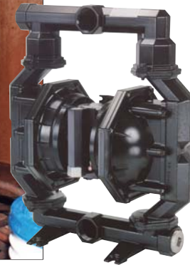
2" PF Series flap valve diaphragm pump