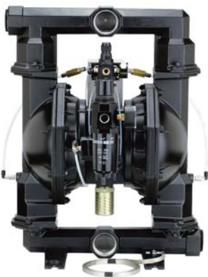
PP20A-BAP-AAA powder pump