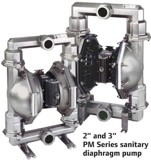
2" and 3" PM Series sanitary diaphragm pump