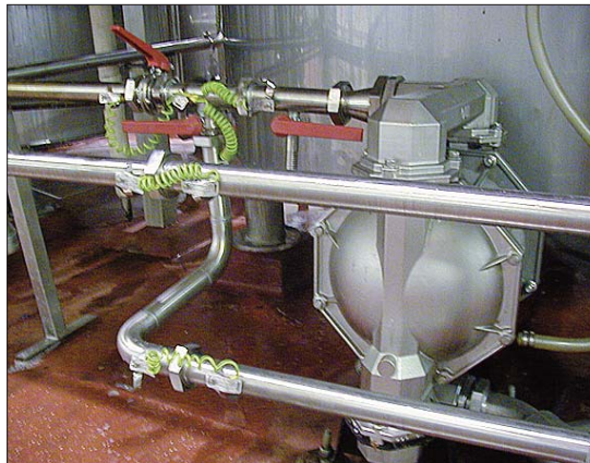
EXP Series Sanitary (FDA) diaphragm pump 3" size, model PM30S-BSS-AAA used to transfer cosmetic basis for shampoos.