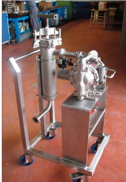
EXP Series sanitary diaphragm pump 1" size, model PM10S-CSS-STT-A02 used to transfer caramel at 130°.