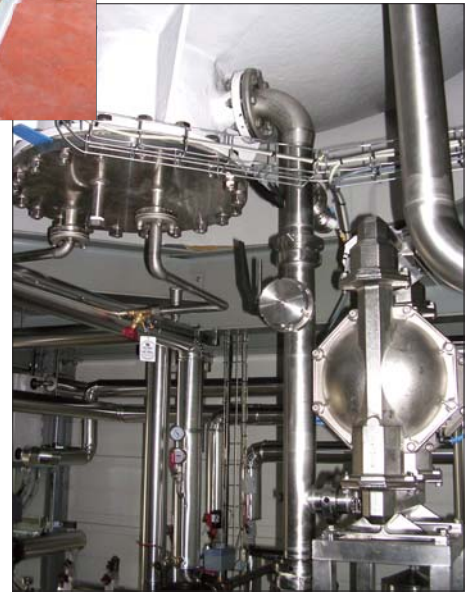
EXP Series sanitary diaphragm pump 2" size, model PM20S-CSS-STT used to transfer glucose in a large bread and pastry manufacture plant.