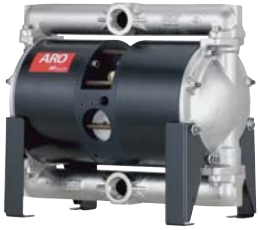
PH10A-BSS-STT 1" 3:1 ratio diaphragm pump