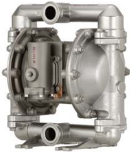
PM10S-CSS-STT-A02 1" sanitary diaphragm pump