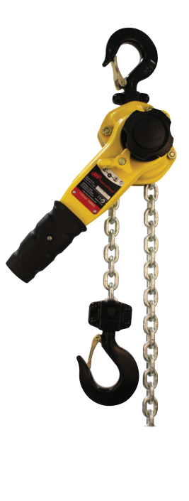
KL lever chain hoists in both compact and ultra-compact designs generate the leverage to move from 0.75 to 9 metric tons, single-handedly.