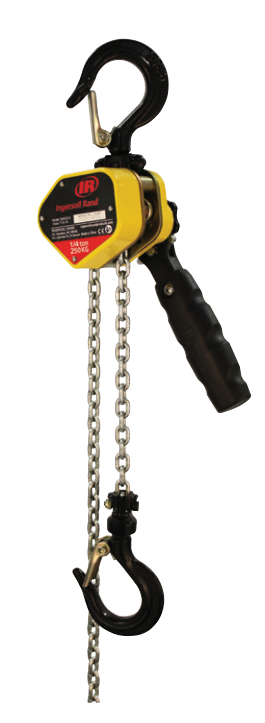
KX SideKick Series mini lever hoists are engineered to be portable and to get in the smallest spaces, lifting from 0.25 to 0.75 metric tons.