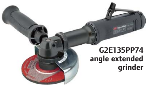
G2E135PP74 angle extended grinder