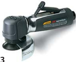
320AG3 Revolution Series angle grinder