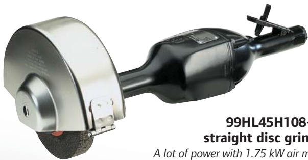
99HL45H108-EU straight disc grinder A lot of power with 1.75 kW air motor Max. free speed 4 500 rpm