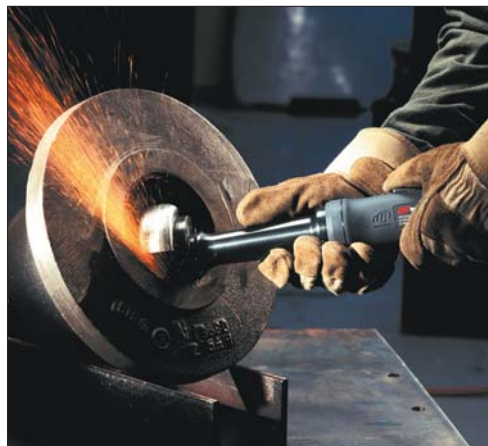
Model G2X180PH63 0.60 kW – 18 000 rpm max. speed.