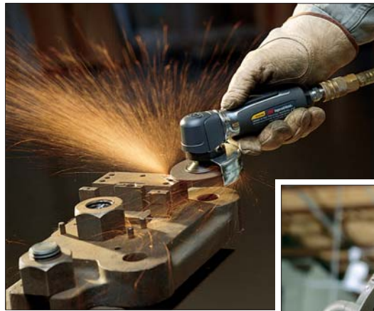
320AG3 angle grinder 0.22 kW – 20 000 rpm.