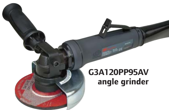
G3A120PP95AV angle grinder