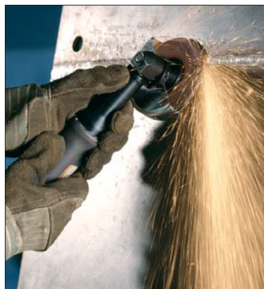
Model G2E135PP74 0.60 kW. 13 500 rpm max. speed. Wheel capacity 100 mm.