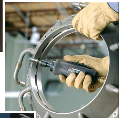
G2H250PG4M straight grinder with 6 mm diameter collet. 0.60 kW – 25 000 rpm.