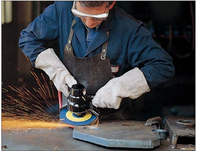
88V / 99V series vertical grinders Available with motor power from 1.50 to 2.25 kW and wheel capacities from 150 to 230 mm.