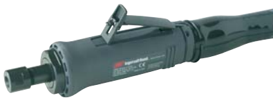
G2H250PG4M straight grinder