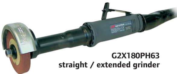
G2X180PH63 straight / extended grinder