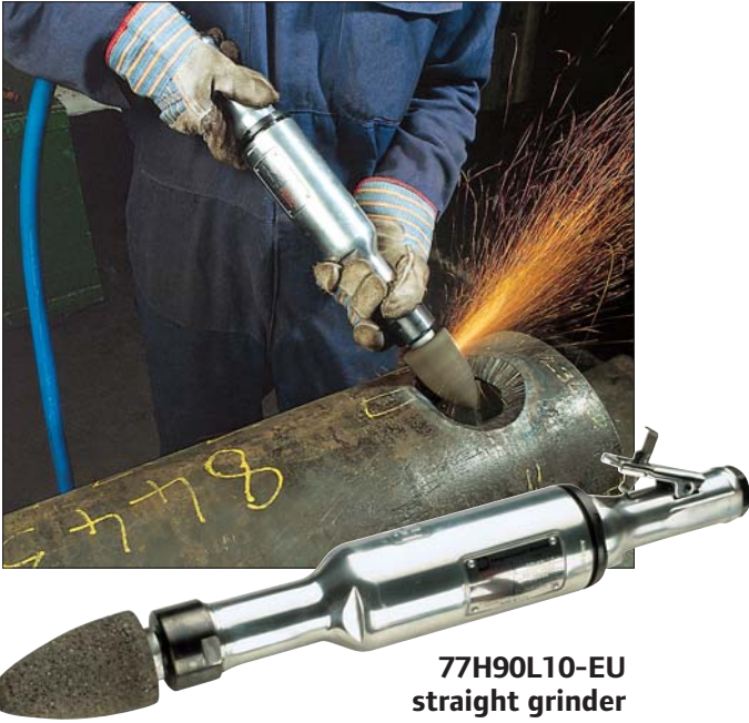
77H90L10-EU straight grinder Motor power 1.12 kW. Max. free speed 9 000 rpm